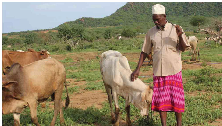
FAO is supporting projects for resilience among pastoral communities in Marsabit County.