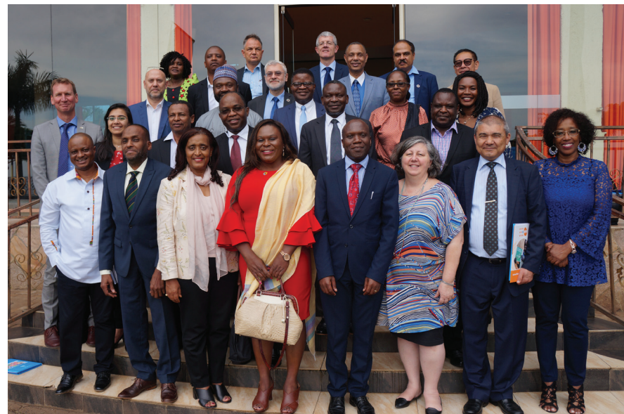
Group photo of UNCT Kenya/Uganda retreat in Entebbe to discuss the Karamoja Cluster Cross-border Programme on 10 October 2018.

https://themasharikinewspaper.com/disarm-all-civilians-in-marsabit-leaders-urge-government/