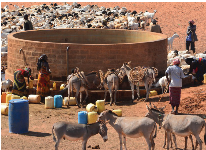
Water well in Marsabit

Migration through the Marsabit-Ethiopian border takes irregular forms such as human trafficking or people smuggling, or entry into Kenya without proper documentation. Although many migrants travel using legal means, irregular migration has become a worrying phenomenon and is contributing to regional insecurity. Different forms of human trafficking and people smuggling incidents have complicated the border situation. The aforementioned drivers of conflict in the region such as resource and territorial control, violent extremism, effects of climate change and poverty, fuel various cross-border migrations, either by force or by choice, and can cause further insecurities for the entire region.