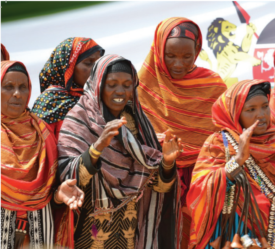
Women group from Marsabit County

proliferation of small arms, human and drug trafficking and general instability that leads to loss of lives and property, all amounting to a humanitarian crisis.