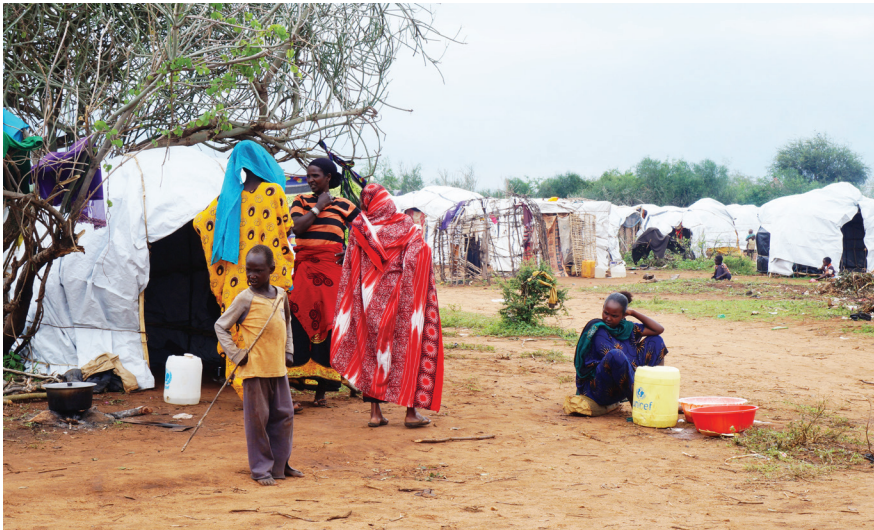
A temporary camp erected in Marsabit County to host communities fleeing an outbreak of clashes in Moyale, Ethiopia, in 2018.