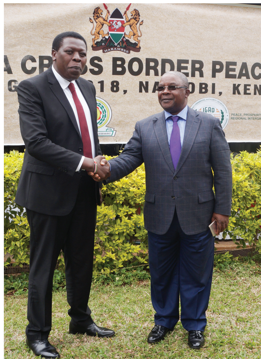
Kenya's Cabinet Secretary for Devolution and ASALs Hon. Eugene Wamalwa (left) with Uganda's Minister for Karamoja Affairs Hon. Eng. John Byabagambi during a meeting in Nairobi to discuss the establishment of a Kenya-Uganda Cross-Border peace initiative.