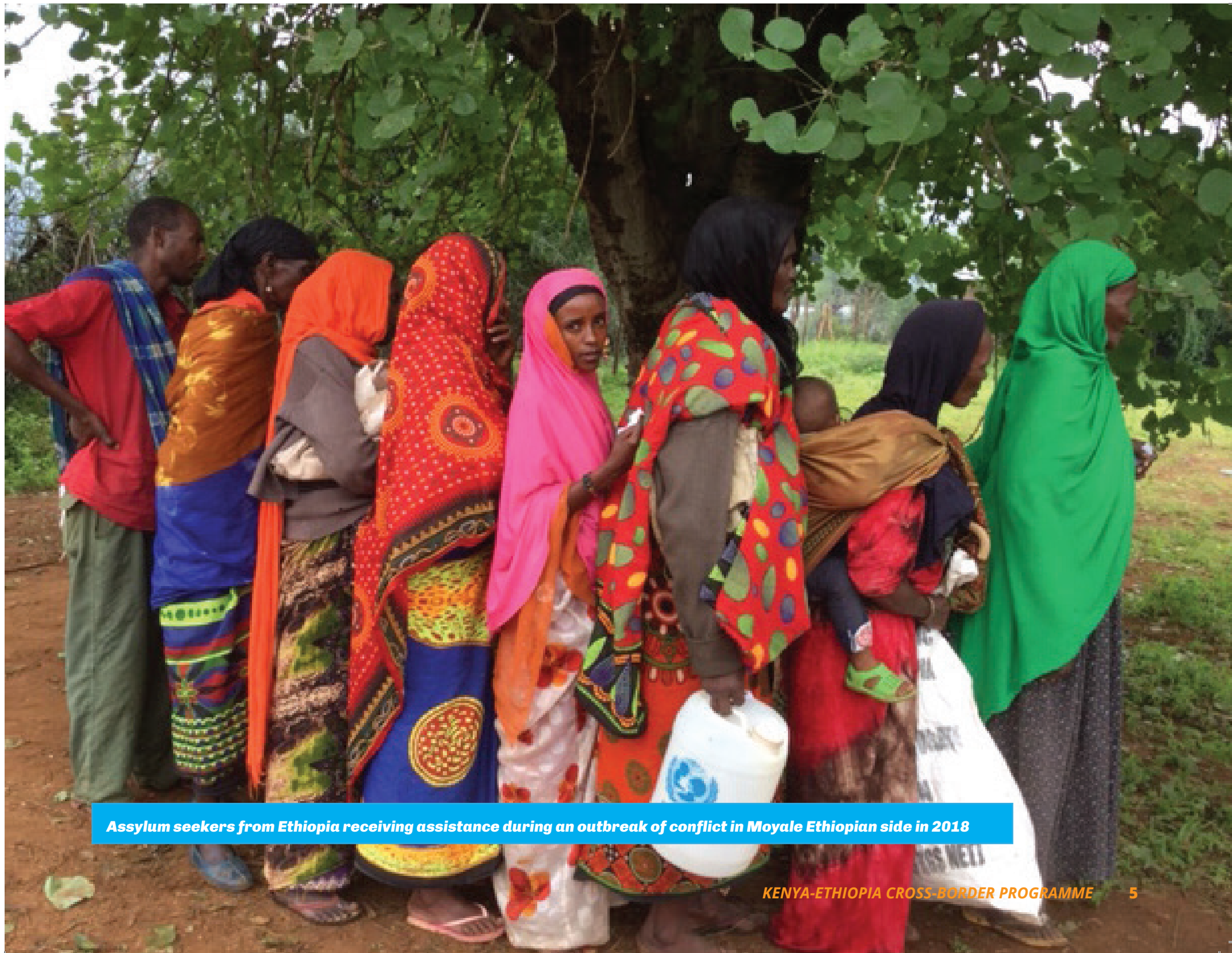
Assylum seekers from Ethiopia receiving assistance during an outbreak of conflict in Moyale Ethiopian side in 2018